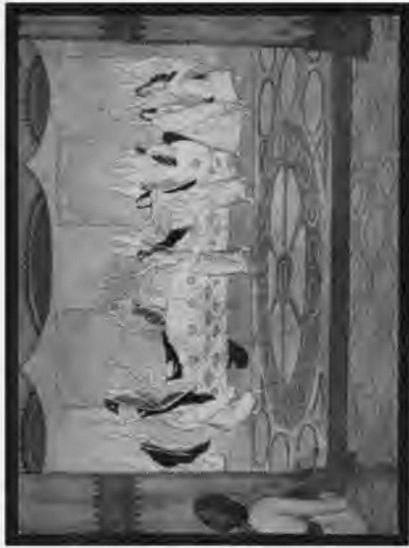
The Feris dance round the dead body of the King of Persia.